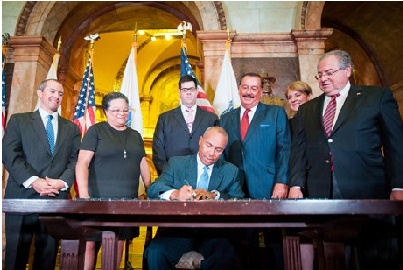
Bill signing at the Massachusetts State House